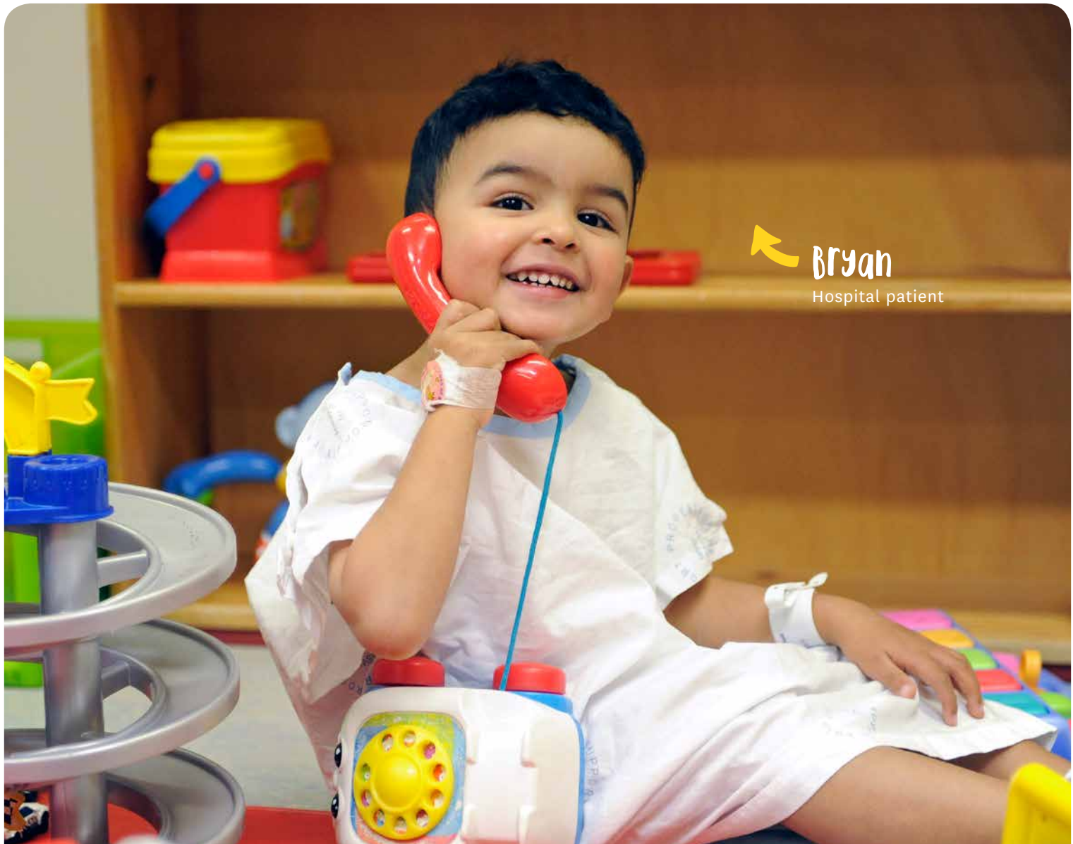
← Bryan Hospital patient